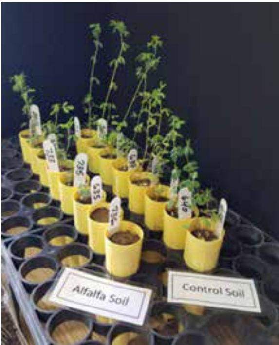
Alfalfa seedlings growing in the soil from grass (control) or alfalfa plots in Task 4.